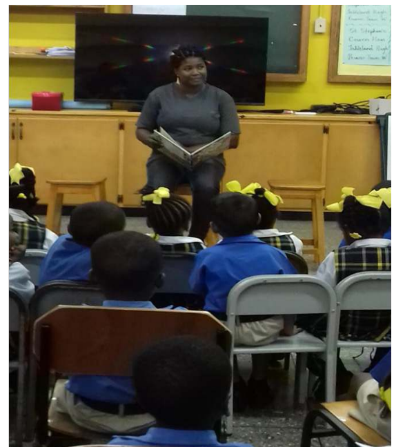
A parent reading to infant classes at the Fifth Company Baptist School.

The (academic) year-long programme focuses on building leadership capacity in principals, and training Infants 1 and 2 class teachers and parents in new, innovate, age appropriate methods of building literacy skills in young children. The Fifth Company Baptist School successfully completed the Leading for Literacy training in 2016 with the Fifth Company Anglican School registered to complete the programme in 2017.