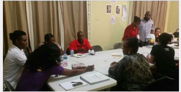
Meeting with Village Council's Planning Committee United Way Trinidad and Tobago works closely with the Planning Committee of the Village Council in Fifth Company Moruga so they are involved each step of the way.

UWTT has partnered with Baptist Church in 2015 on the renovation of a space that was started as a training centre more than 10 years ago to be used as the Project Office for the Community and by the Community.