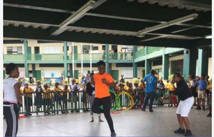
Teacher training and children practising new skills.

Participation in a structured sporting activity or music programme helps students improve their work-study habits, homework completion rates, and school rates. It also helps students to build self-esteem, improve relationships with peers and adults. In turn, increased student engagement and performance in school can contribute to the student's overall educational attainment.