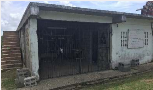
Proposed site for community space renovation