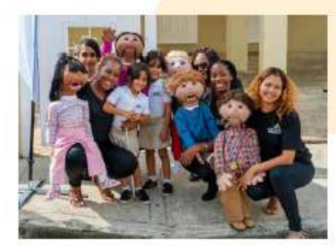
Caribbean Kids and Families Therapy Organizations Small Grant Project