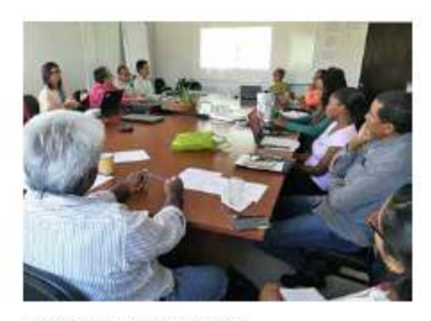
SDG Catalysts Network Members Quarterly Meeting